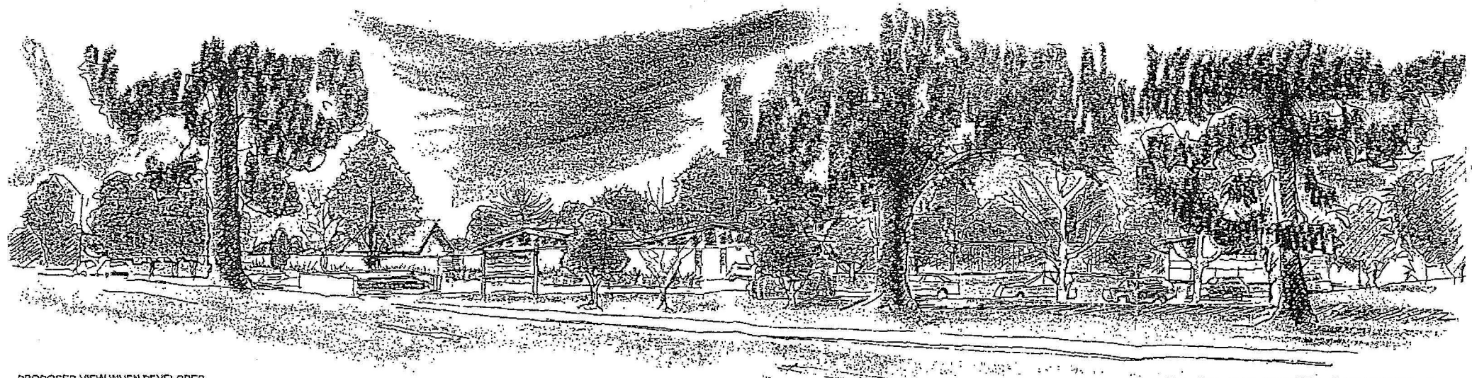
PROPOSED VIEW WHEN DEVELOPED